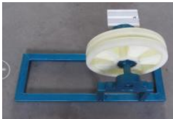
The pulley with depth counter