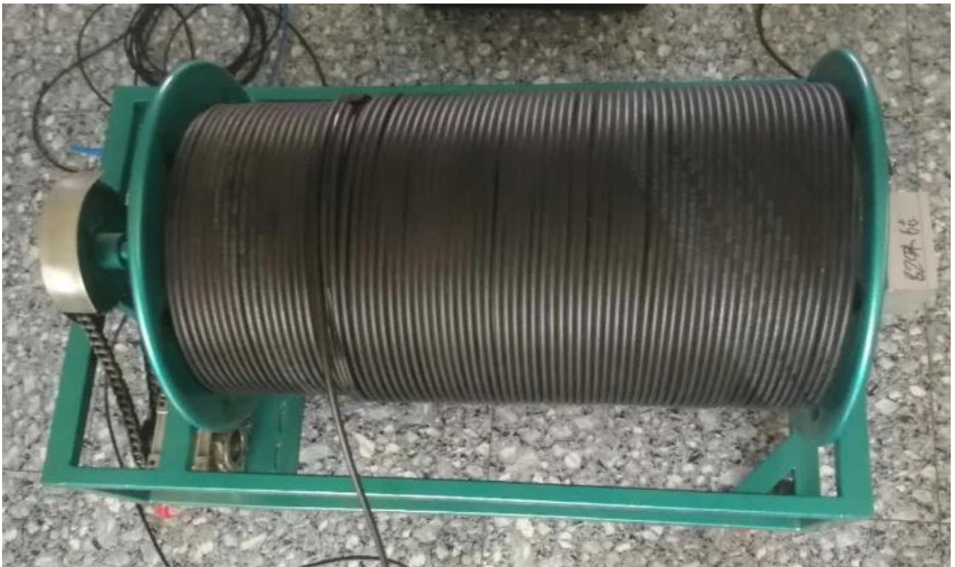
The electric winch